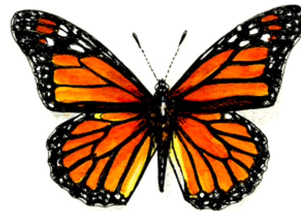
Monarch drawing by Kandy Vermeer Phillips

Including Sedona, Cottonwood, Clarkdale, Page Springs, Camp Verde and Rimrock